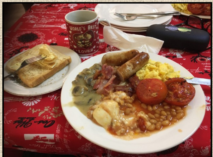
What you see in the photo being the meal served for R65 p/p.