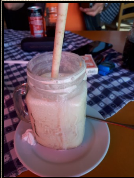
Double Thick Peanut Butter Milk Shake

K nowing the restaurant portion sizes, most ordered only a HALF portion which was really very filling. For a last "cheat", some ordered milkshakes which were topped up with a good size helping of ice cream served with a straw the size of a conduct pipe so one can get the creamy tasty milkshake down the hatch.