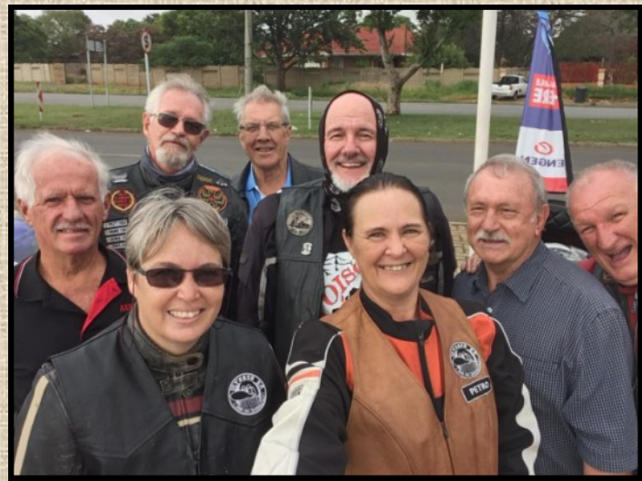
Carletonville / Fochville Riders

When leaving the Sasol garage the group had grown to 22 and then a late Gold Wing Trike ridden by Mama Kawa with George as pillion met up with the group at the Clubhouse pushing the total up to a 24 of which 5 were Ladies.