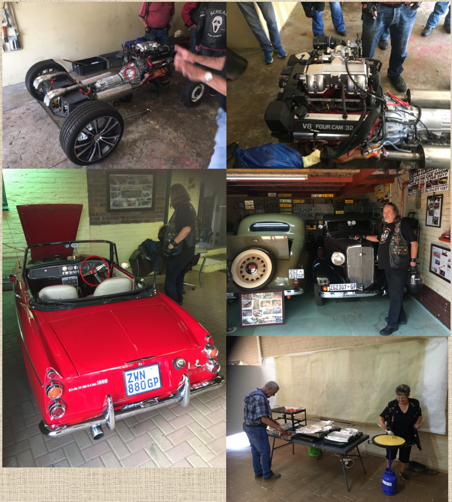
A collage of photos taken for the day.